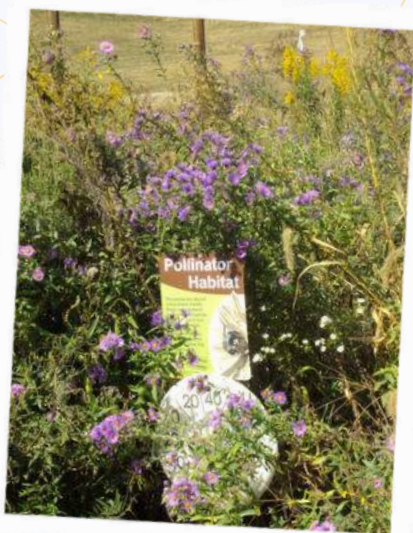
Pollinator habitat at Oblate Ecological Learning Center. Learn more about pollinator conservation at: https://www.xerces.org/