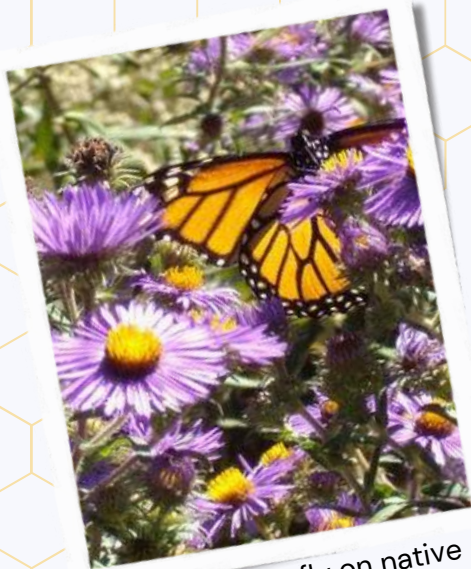
Monarch butterfly on native New England asters