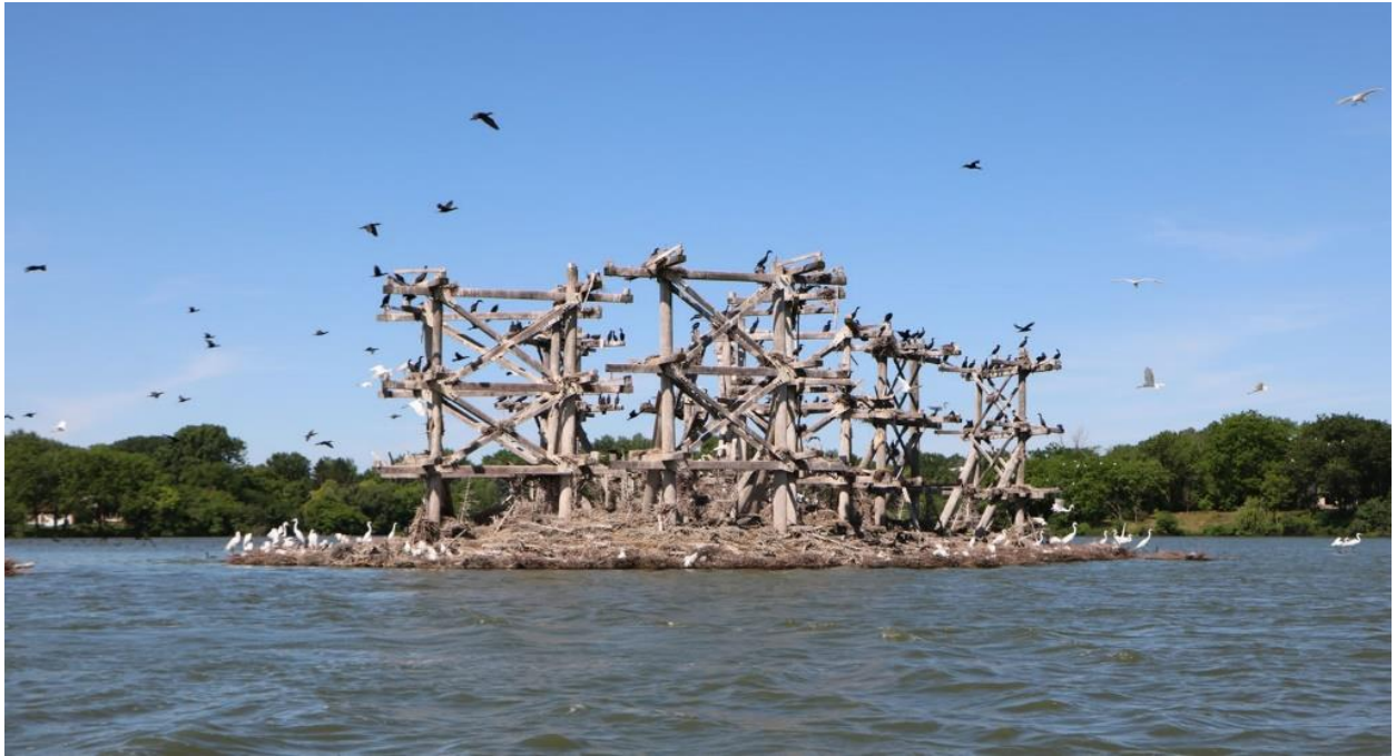
Blue heron habitat at Baker's Lake

Maintaining a healthy and biologically diverse ecosystem is considered critical to the area's vitality. It provides benefits by absorbing and filtering stormwater, providing wildlife habitats, filtering air pollutants, storing carbon, and providing aesthetic and recreational value.