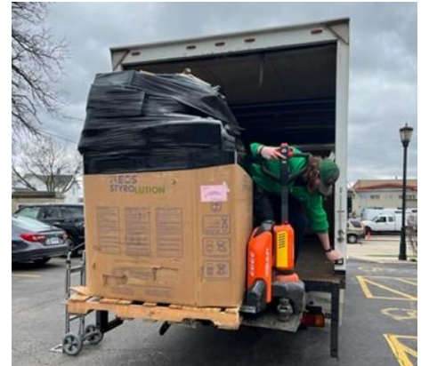
1 of 14 pallets of recycled electronics