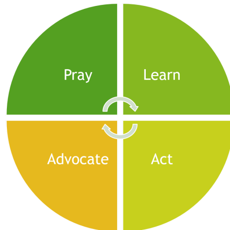
Figure 1: Pray, Learn, Act, Advocate Model

Recognizing the importance of context and culture, the Vatican promotes flexibility regarding the form that each institution's plan takes. For our parish plan, our Healthy Earth Team has identified four areas of focus that each capture between one and three of the broader LSAP goals. These four areas are: Pray, Learn, Act, and Advocate .