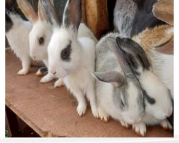
We have committed to practice more humane ways of animal rearing

expand their businesses or use their savings to fend for their families. This year, we have supported 24 people with money for start-ups. In our schools, the students also reach out through donations to the vulnerable people every year during Lenten season and also on other occasions.