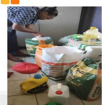
Loreto convent Mombasa sorting out foodstuff for donation to vulnerable children